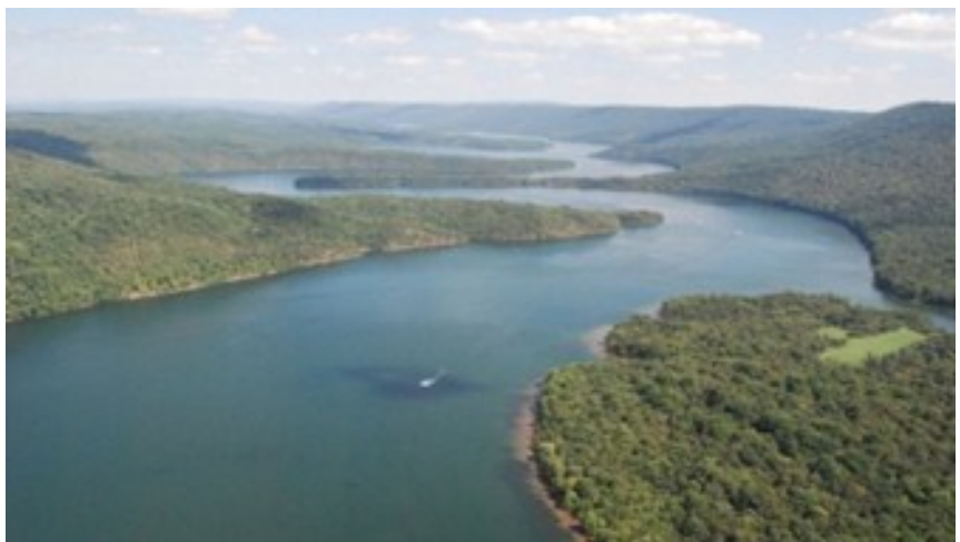
Lake Raystown, near Altoona, PA

To all committee members, Kudos, For a job well done!!